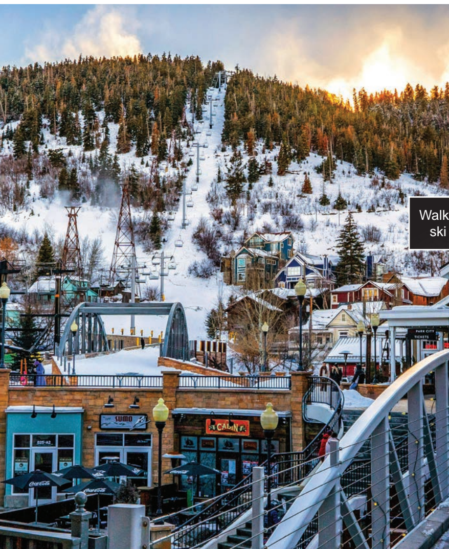
Walk to Town Lift of PCMR- largest ski and snowboard resort in US

OLD TOWN 675 MAIN STREET | PARK CITY, UTAH 84060