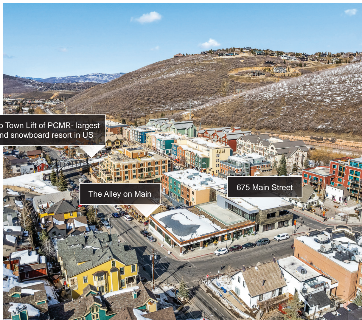
The Alley on Main